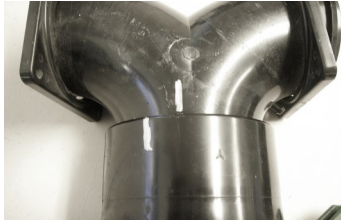
OUT OF ALIGNMENT