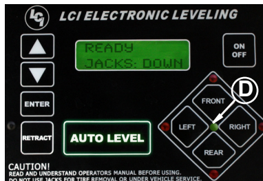
Fig. 3 Touch Panel - Unit Level