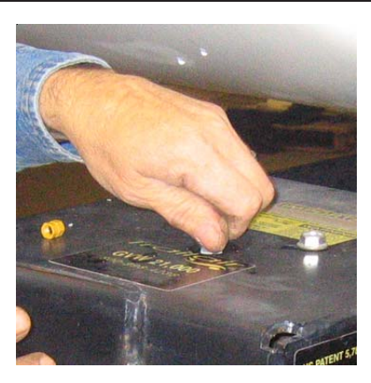
Deflate air bag and remove valve, and mounting bolts.

Take measurement from floor to pin plate on bottom of pinbox, "A." The Tri-Glide lower jaw sets 1 1/2" lower than the Trailair lower jaw. The pinbox may need to be raised or the hitch lowered to accommodate the difference.