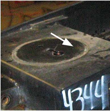
Remove lower jaw slowly, jaw is heavy. Works best by simply lowering forks of the forklift. Slide airbag over and disengage.