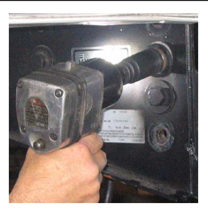
If pinbox needs to be raised to accommodate Tri-Glide lower jaw, while supporting pinbox with forklift or jacks, remove mounting bolts and remount pinbox in the next set of higher holes.