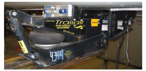
Trail-Air Pinbox with standard lower jaw.