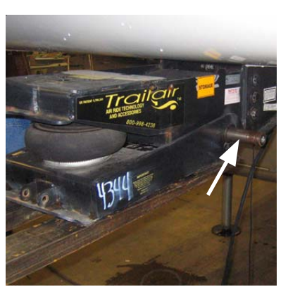
Remove lower jaw pivot pin.