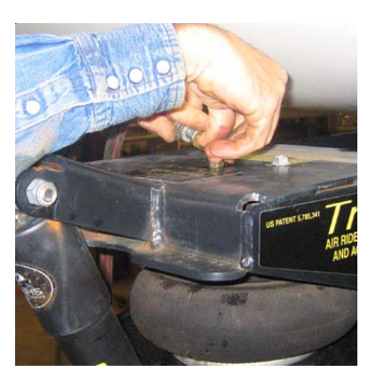
Fill airbag. Test airbag for leaks using soapy water procedure.