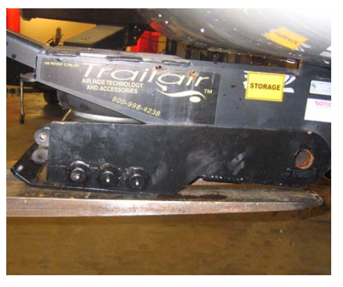
Lift Tri-Glide jaw into place.