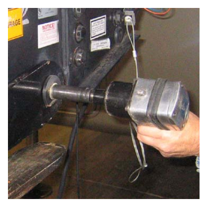
Tighten pivot pin bolts. Torque bolts 90 - 110 ft. lb.