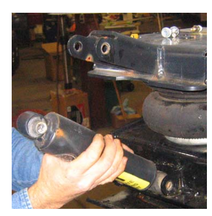
Install shock, do not tighten bolts yet.