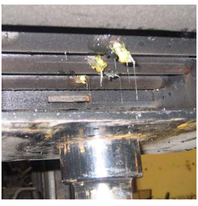
...and 3 up and underneath the back side of the pinbox.