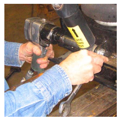
Tighten shock mounting bolts. Torque bolts 90 - 110 ft. lb.