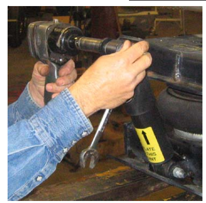
Disengage shock bolts and remove shock.