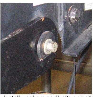
Install washers and bolts on both sides do not tighten yet. Torque bolts 90 - 110 ft. lb.