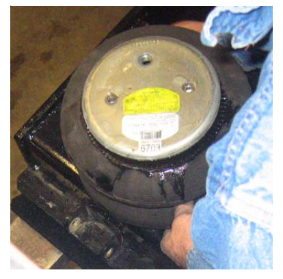
Set old lower jaw aside and place the Tri-Glide lower jaw in it's place. Mount airbag. Place bolt head in hole and slide into place.