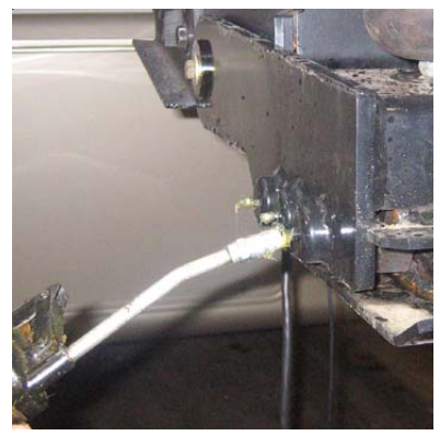
Grease all zerks, there are a total of 9; 3 on each side of the Tri-Glide jaw...