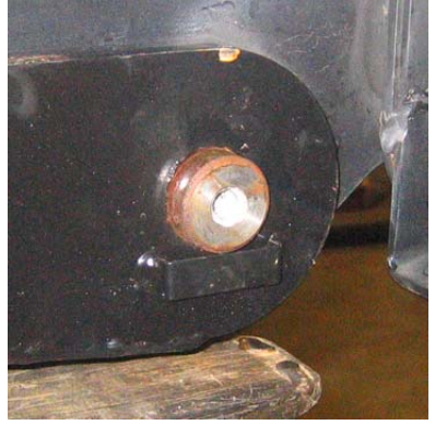
Place pivot pin in hole and push into place.