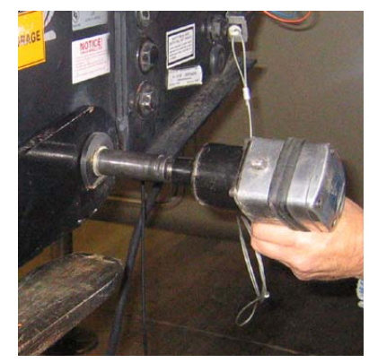
Remove lower jaw pivot bolts and washers on both sides.