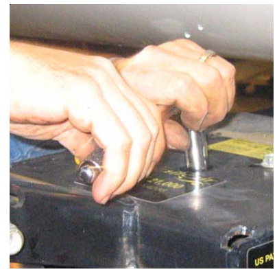
Replace air valve and air bag mounting bolts, tighten into place.