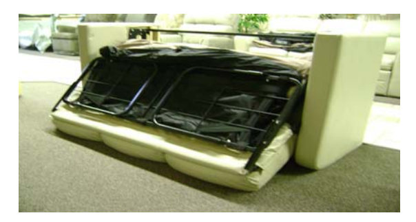
Confidential Page 1 5/6/2008

After drawer is removed, make sure the sofa is un-secured from the floor (& wall?) and the slide sofa is pulled out from the wall. Tilt sofa onto the front face of the armrest. (Remember the backrest will want to rotate forward when tilting sofa on front face of armrest- so hold onto the backrest and lower it to the floor).