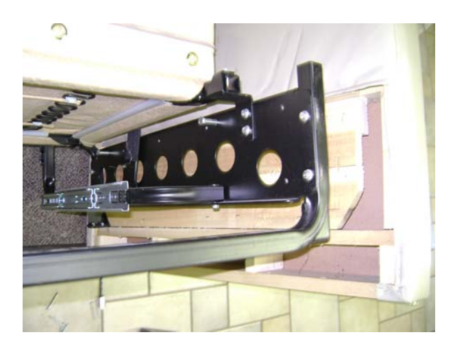
Confidential Page 2 5/6/2008